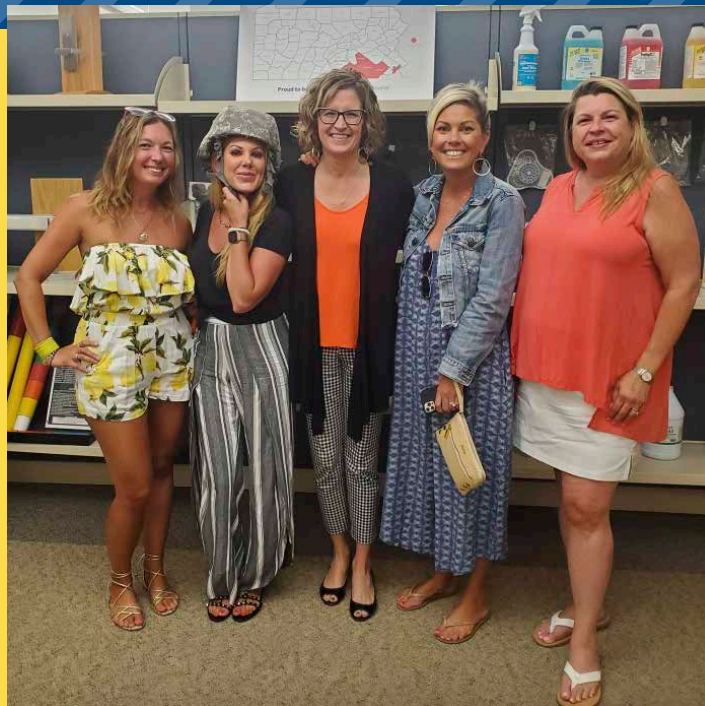
The planning committee for Elksgiving recently toured VisionCorps.